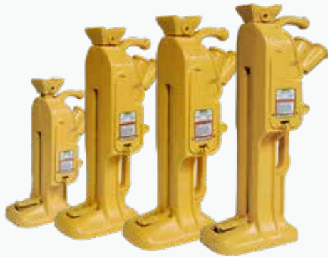
RJ84A, RJ85A, RJ1017 & RJ86A Shown

Capacity Range .....▶ 5 - 20 tons Stroke Range .....▶ 7 - 21.25 in. Maximum Toe Height Range .....▶ 1.62 - 2.25 in.